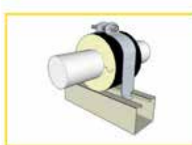
▶ With Pipe Support Element