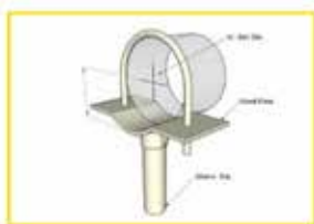
▶ With U-Bolt and Pipe Support